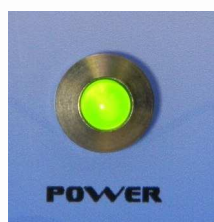
Easy visual check for operation