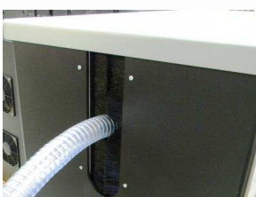
Pipe and cable are going through a polypropylene brush