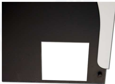
Lateral window for easy oil level check